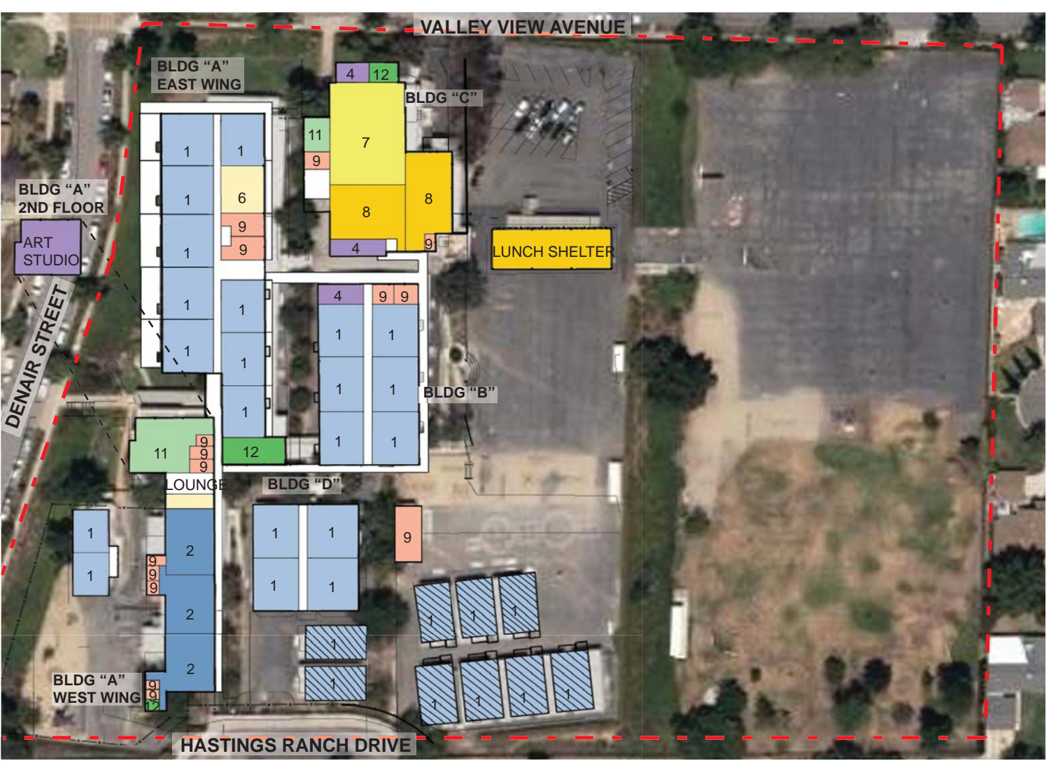
SITE SIZE: 8.90 ACRES